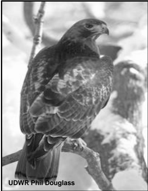
UDWR Phil Douglass