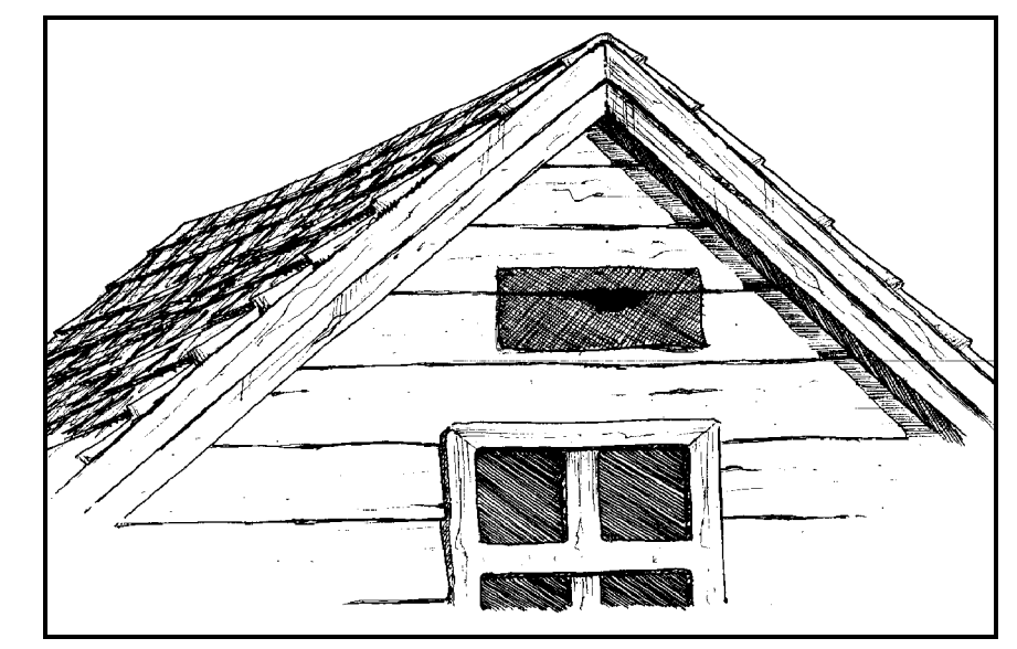
Figure 2. Bird netting is placed over the hole, and stapled tight along the top edge and down both sides. The bottom is left open. When the bats leave they hit the netting and crawl down the siding and out the open bottom. When they return they are unable to fly back up under the netting, and cannot return to their roost.

To determine how and where bats may be entering buildings, the outside of the building should be examined for small gaps in siding, openings around chimneys, or where walls meet the roof. Bats prefer entrances 12 ft. (3.6 m) up or higher, but will use any small natural gap they can fit through. When the bats emerge at dusk to feed, watch the building and note where they are exiting. Small accumulations of guano on the ground may provide another clue to the whereabouts of a difficult to locate entrance.